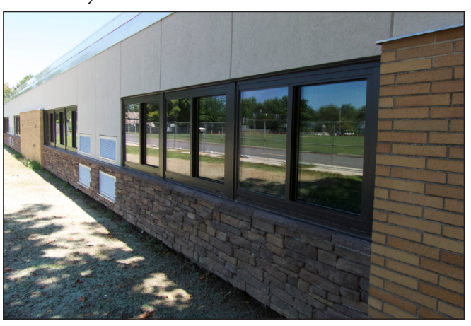
Energy-efficient windows at Herbert Hoover ES