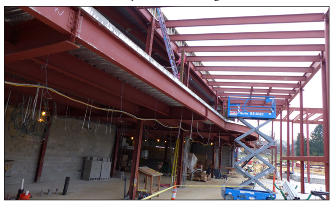
Interior 'Main Street' at the new Tawanka building