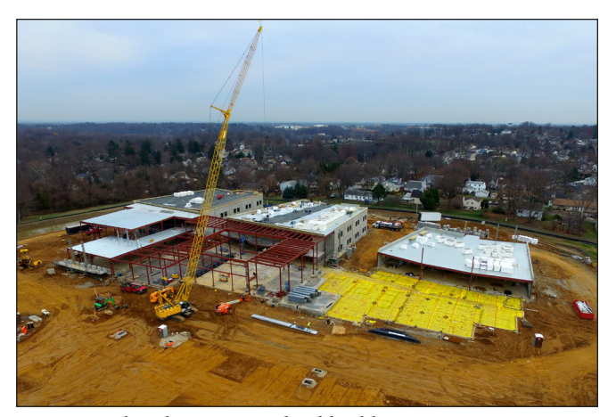
New Tawanka Elementary School building