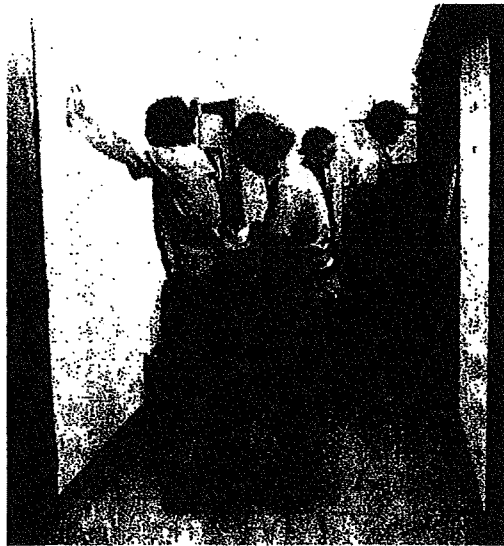
FIGURE 37-2 Stanford Prison "Guard" frisking new "Prisoner." (Zimbardo's Stanford prison experiment)

The "Guards" Unlike the prisoners who were required to be in the prison 24/7 (they were incarcerated, after all), the guards worked 8-hour shifts, three men to a shift, and lived their normal lives when not on duty. They were given identical prison guard-style uniforms, nightsticks (although they were not allowed to strike prisoners), and reflective sunglasses designed to give them a menacing and anonymous appearance. Zimbardo explained that his idea for the mirrored sunglasses came from the 1967 film Cool Hand Luke , starring Paul Newman (Zimbardo, 2007). The guards received no