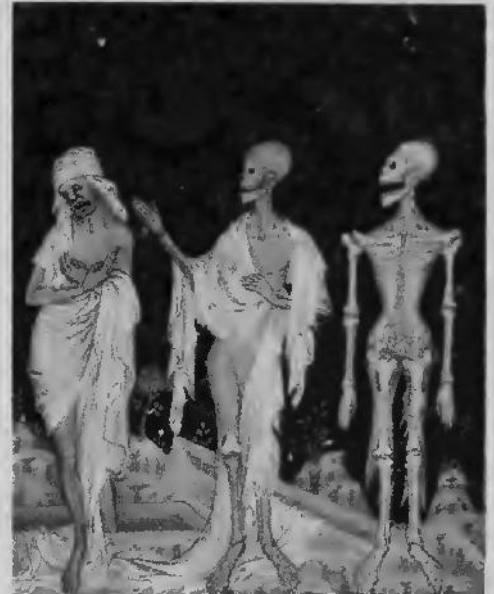
The Three Dead, from the Psalter and Prayer Book of Bonne of Luxembourg, Duchess of Normandy (14th century), fol.322r. Grisaille, color, gilt, and brown ink on vellum (4 15/16" x 3 9/16"). French, Paris. The Metropolitan Museum of Art, New York. The Cloisters Collection

300 Dearly beloved, God forgive your sin And keep you from the vice of avarice!