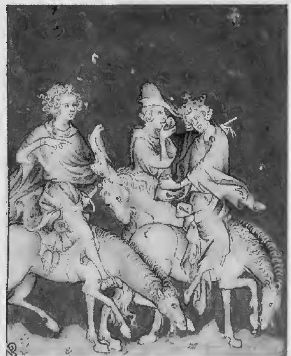
The Three Living, from the Psalter and Prayer Book of Bonne of Luxembourg, Duchess of Normandy.

178 "Fortune" here means "fate." Do you think the young men will be blessed by Fortune?