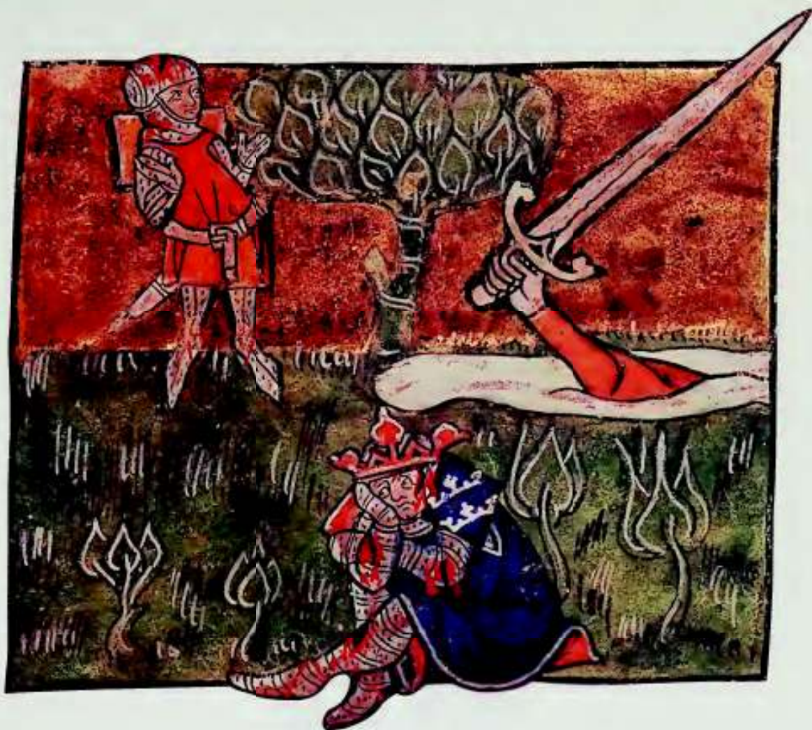
Illustration from an illuminated manuscript showing a wounded Arthur in the foreground waiting for Sir Bedivere, who watches a hand appear from the lake to take King Arthur's sword, Excalibur.

"Sir Bedivere, weep no more," said King Arthur, "for you can save neither your brother nor me; and I would ask you to take my sword Excalibur to the shore of the lake and throw it in the water. Then return to me and tell me what you have seen."