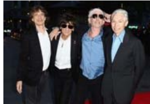
The Stones

The gamble being taken by anyone buying or selling at that high a level is that the Stones won't be back. Which doesn't seem like a very smart bet. As Ronnie Wood said Thursday night, "Once this wheel is turning I don't think